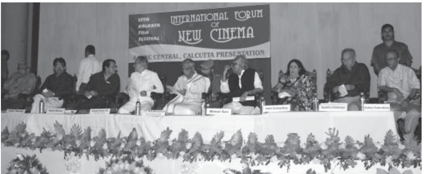
Guests on the Inaugural Ceremony at Metro Cinema